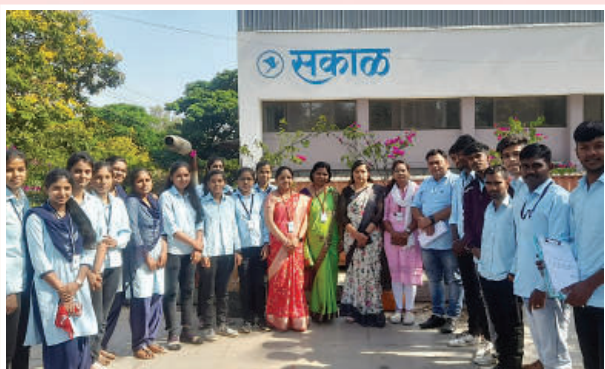
Study Tour at Sakal Newspaper Press

An Educational Trips and Study Tours are organize every year by the college for getting curricular knowledge to students. The Industrial visits are organise at different nearby places by various departments for getting practical knowledge to students. Here are some glimpses.