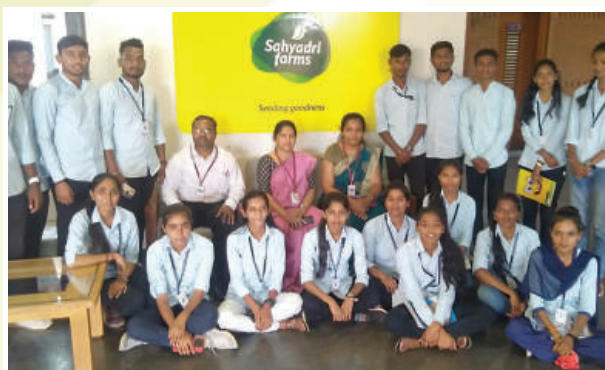
Industrial Visit of Dept. of Economics at Sahyadri Farms