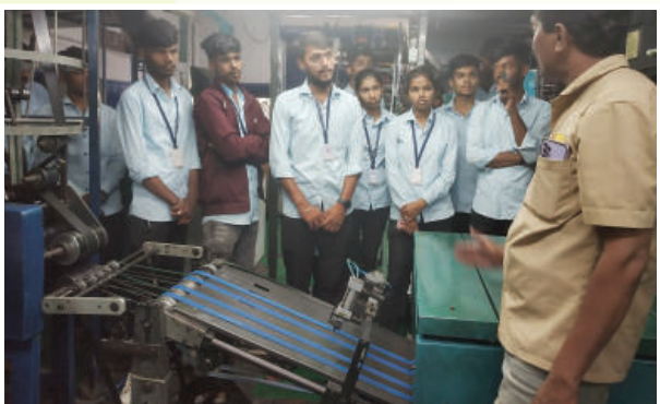
Industrial Visit of Dept. of Commerce at Khadi Gram Udyog