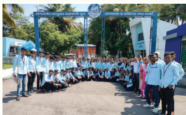
Industrial Visit of Dept. of Commerce at Rajhans Dairy