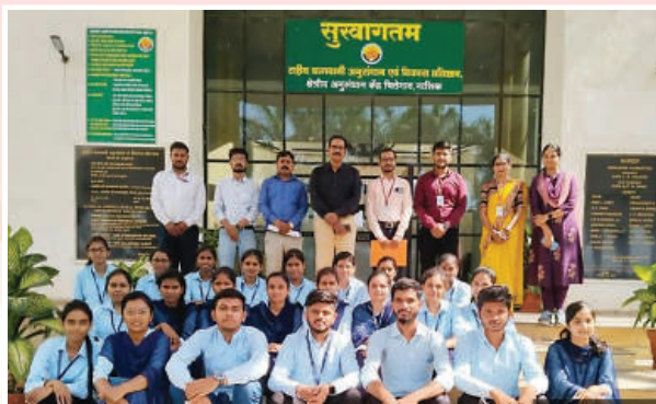
Education Visit of B.Sc students at NHRDF, Chitegaon