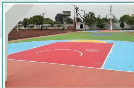
Basket Ball Court