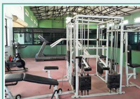
Six station Gym