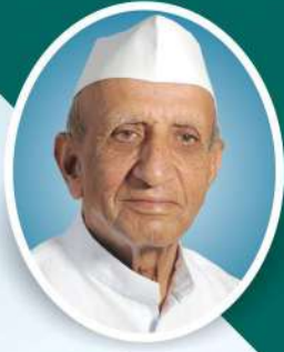
Founder & Visionary of K K Wagh