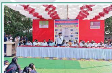
Dept. of Sports