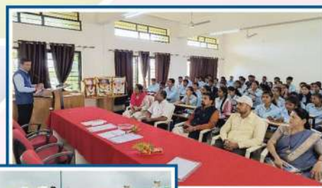
Workshop on Antiaging